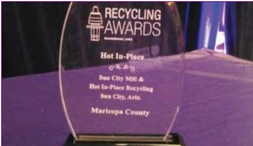
The project was selected as the Roads and Bridges Hot –in-Place recycling project of the year by the Asphalt Recycling and Reclaiming Association.

Here are the facts for the costs of just the recycled section. The total cost was $675,722 for the 218,095 square yards. That is a cost of $3.098 per square yard. The estimated savings was conservatively estimated to be at least $500,000. The roadway surface is like new and the appearance is also good. The ride and smoothness are very good. In short, hot in-place recycling is a good candidate for a sustainable practice for the future since it is lower in cost, uses less material, generates less greenhouse gas and produces good results. The caveat is that a potential project should be large enough to justify the mobilization costs and the roadway area recycled should be large enough to justify bringing in large equipment of this type.